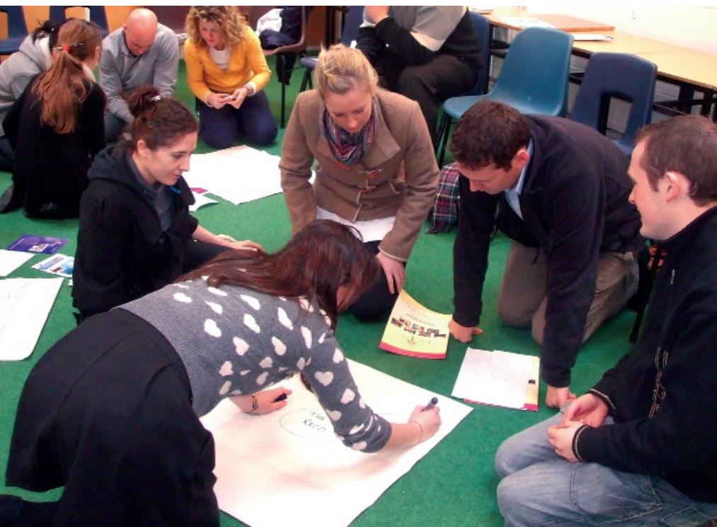
Teachers learning about Ballymun

A variety of organisations in Ballymun offer different types of training. We commissioned research to examine the needs of local trainers and discovered that they wanted a peer support network. The Trainers Network was launched in 2008 to help people involved in the delivery of education and training programmes. Events organised by the network have included quarterly meetings, a seminar on official qualifications, equality training and training on motivating learners. An online list of local trainers and their training courses is currently being drawn up and can be viewed on the Partnership website www.ballymun.org